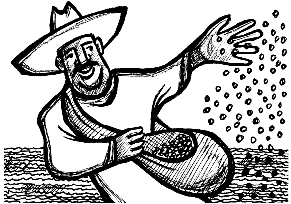
© J. S. Patuch Co., Inc.

The kingdom of heaven is like a farmer who sowed good seed